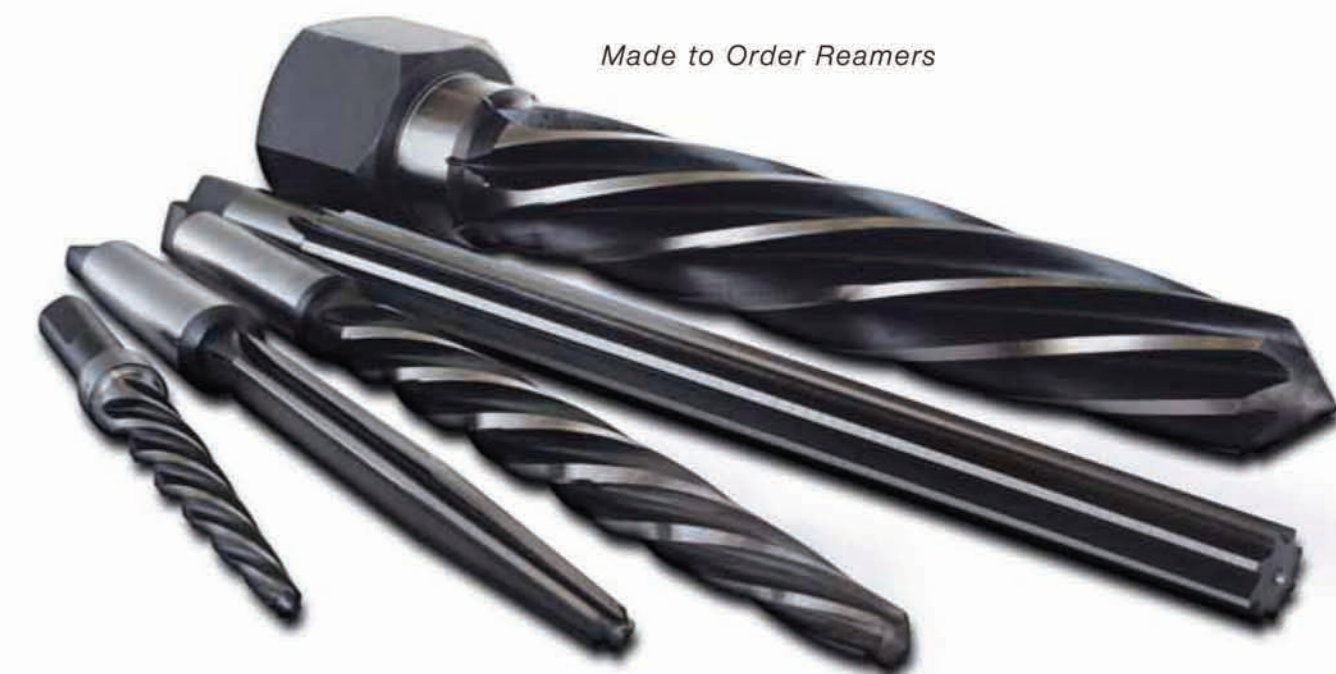
Made to Order Reamers

In-house TiN or TiAlN surface coatings can be applied to the full reamer range of standard and custom products prior to shipment. These Oerlikon Balzers coatings extend reamer life by as much as two to ten times depending on the specific application.