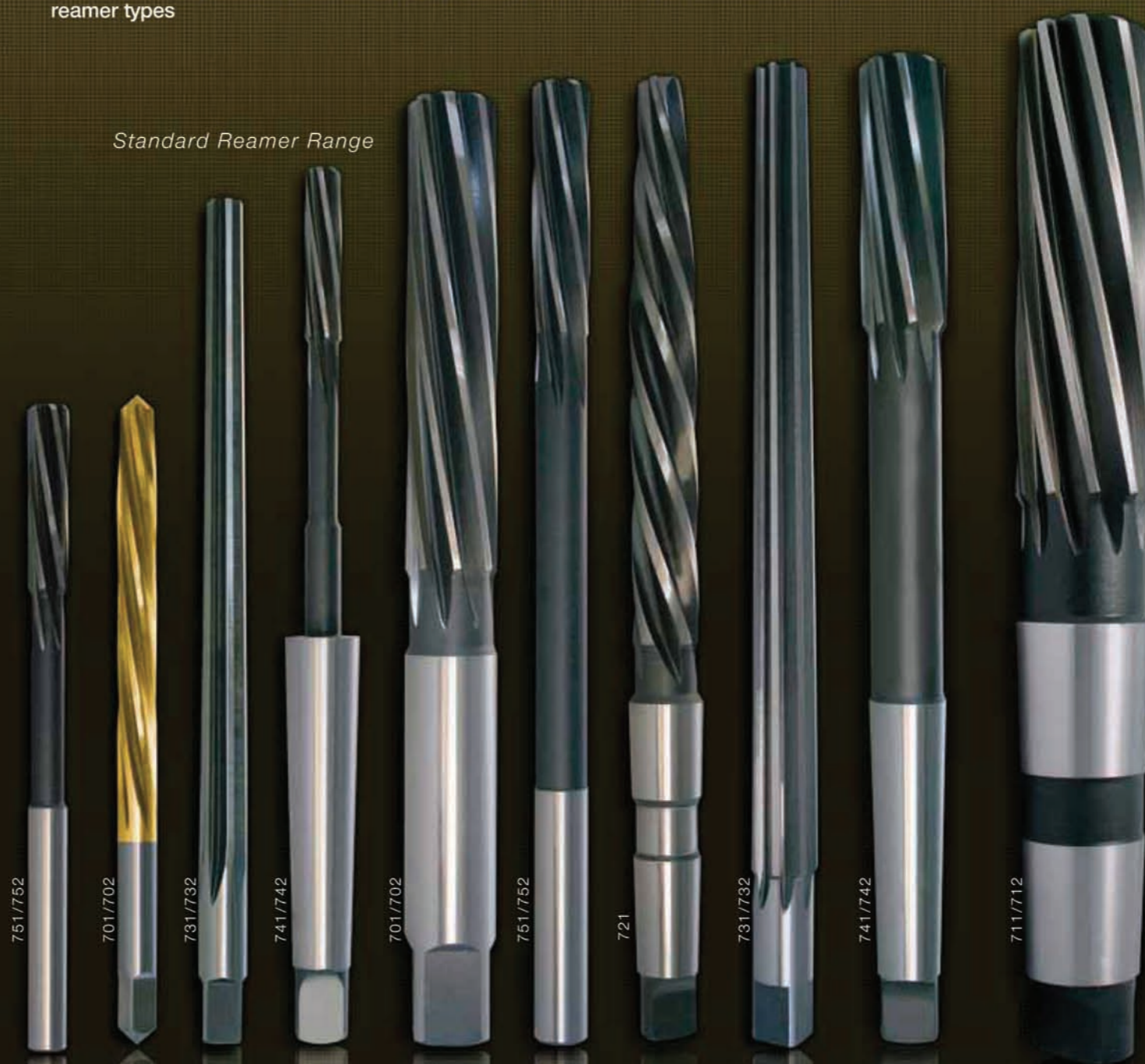
Standard Reamer Range

Contact our technical department for advice on any reaming application or problem, and we will design a reamer to suit your specific application. Alternatively, full product specifications may be found in our catalogue for each of the standard reamer types